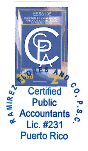
RAMIREZ FLORES AND CO, PSC CERTIFIED PULIC ACCOUNTANTS License No. 231 expires on December 1, 2024