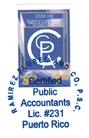
RAMIREZ FLORES AND CO, PSC CERTIFIED PULIC ACCOUNTANTS License No. 231 expires on December 1, 2024