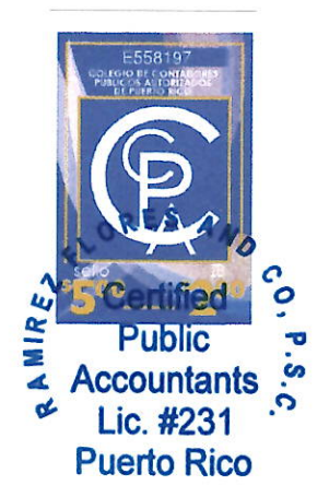
RAMIREZ FLORES AND CO, PSC CERTIFIED PULIC ACCOUNTANTS License No. 231 expires on December 1, 2024